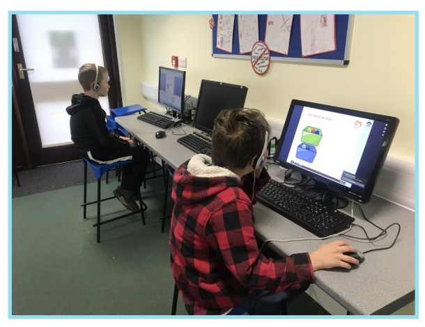
Bubble 3 have been focussing on their White Rose Maths lessons in the computer room.