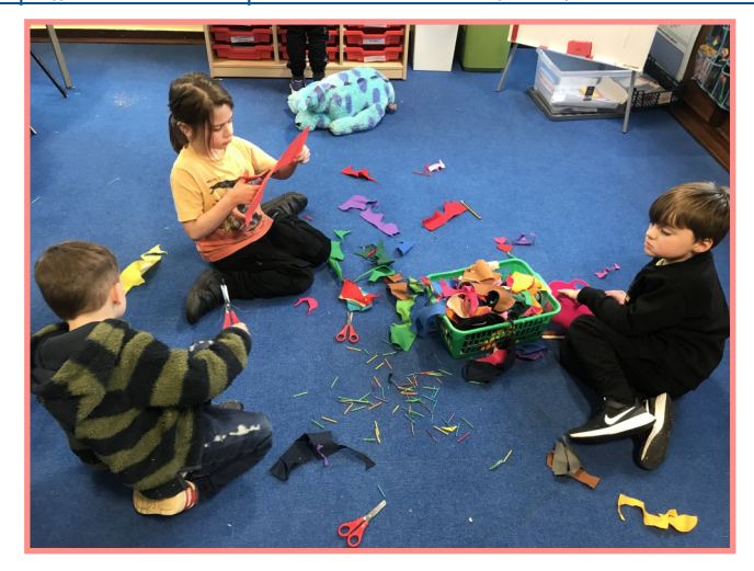
Bubble 1 have been cutting and making insects.

https://www.archbishophuttons.lancs.sch.uk/class/collective-worship