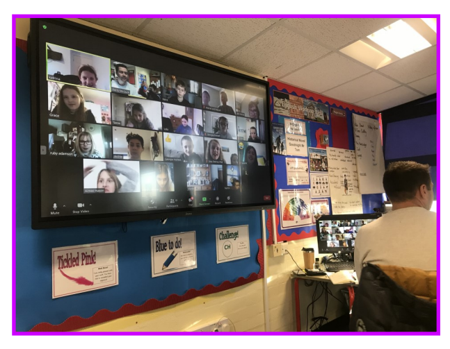
Bubble 4 have been learning all about relative clauses (and how to use Zoom.)