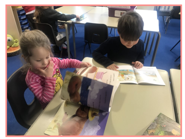
Bubble 2 are keeping up with their phonics and enjoying their books.

We have now finished our third week of remote learning and I think we are now getting the hang of it. We've had to conquer technology, learning in a different way and missing our friends. All of the staff are very proud of everyone (adults and children) for the hard work you are putting in to your school work and the great response to the work being set on the website. Keep it up everyone. Here are some of the things that have been going on in school and at home.